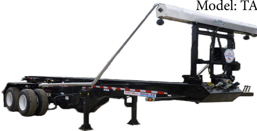
Model: TASM28S - Canadian Spec