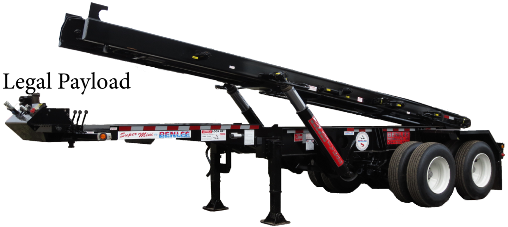
Model: TASMTC26S - Dual Cylinder